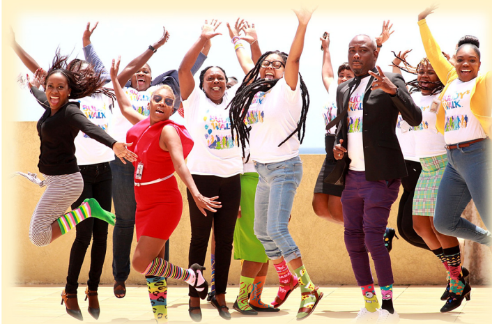
Photo above: The Central Administrative Services Tobago (CAST) Crew.

The Office of the Prime Minister' (Central Administrative Services Tobago, Gender and Child Affairs) rocked their socks in support of World Down Syndrome Day under the theme 'We Decide'.