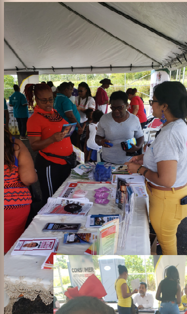
Highlights (left and below): Morgua